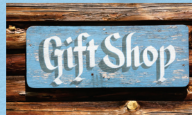
Spring Gift Shop