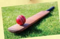
Boys vs Parents Cricket Match

Regular seminars, Clothes Recycling Days, bake sales, second-hand uniform shed, and dress-down days also return. Plus, we're keen to explore fresh ways to support wellbeing, community, and fundraising.