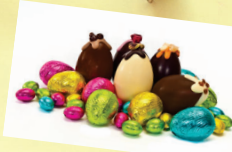
Easter Egg Tombola